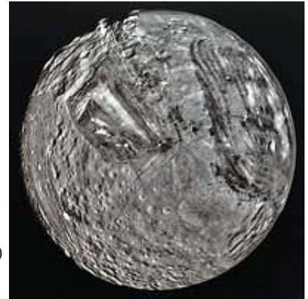
Miranda, a satellite of Uranus, has three regions called ovoids whose outer ridges resemble race tracks. Internal geological activity created the ovoids, probably in the past 2 billion years.

http://www.nasa.gov/worldbook/uranus_worldbook.html